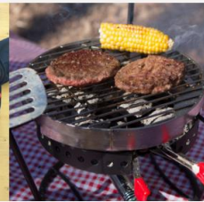
Flip Grill $ 24.99