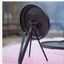
Kick Stand $ 16.99