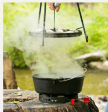
Lid Lifter $ 39.99