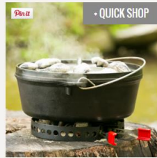
CampMaid Charcoal/Wood Holder & Adjustable Heat Source $ 24.99