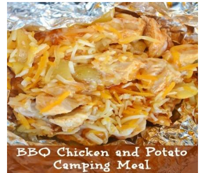
BBQ Chicken and Potato Camping Meal