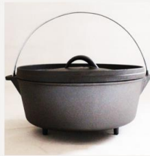
Dutch Oven $ 54.99