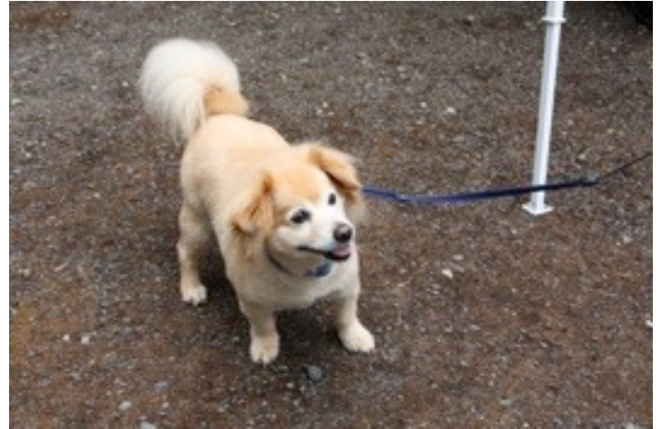
Scruffy in July 2010

There was not a mean bone in this body. We all loved Scruffy and will be missing him for many years to come.