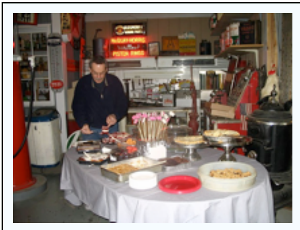
by Herb Kipp