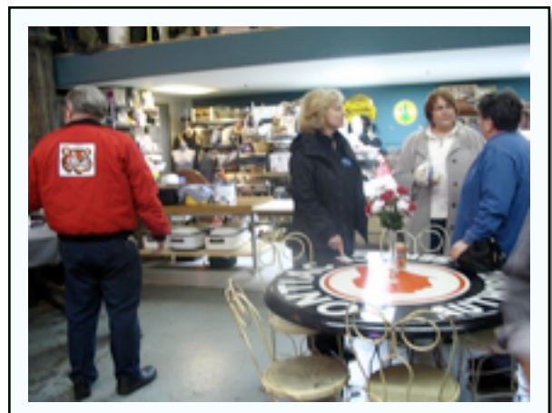
by Herb Kipp